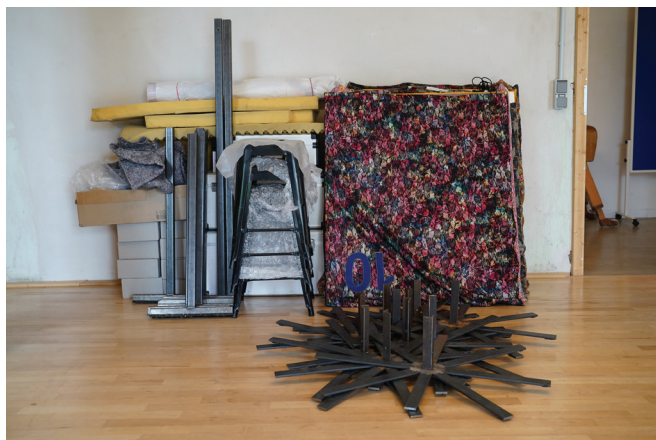
Photo: scope of the packed exhibition for transport

The exhibition is stored in Nürnberg. A small van is needed for transport. Protective covers for the panels are available for transport. The technology and small parts are packed for transport in 3 lockable aluminum cases.